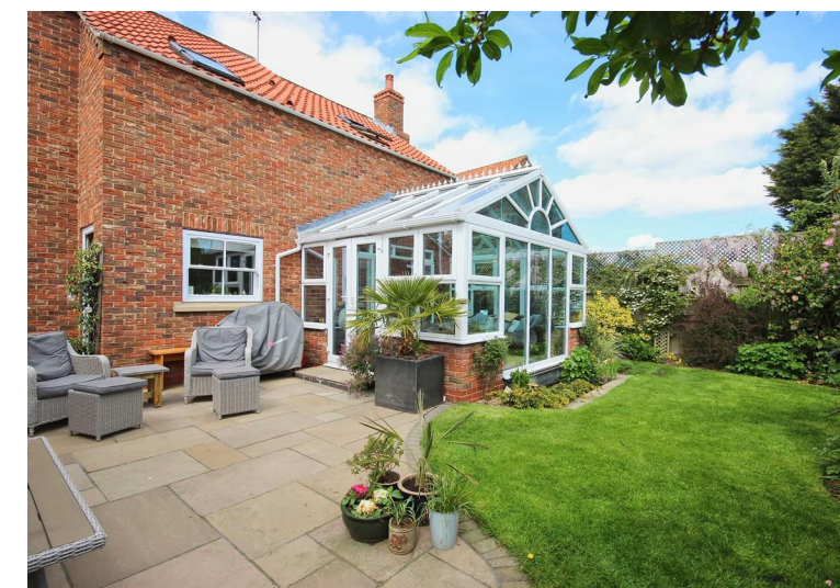
Spring House, 3 Blenheim Walk, Brandesburton YO25 8RZ Offers in the region of £395,000